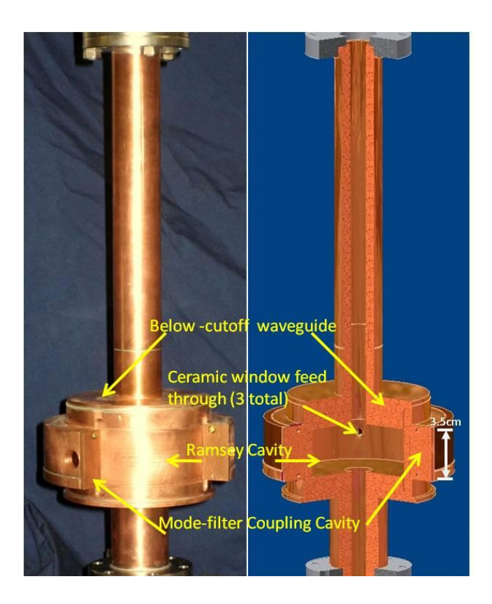
Figure 1. On the left is a photo of the Ramsey cavity and on the right is a drawing with a cut-away view.

Distributed cavity phase (DCP) shifts are a central concern in atomic fountain frequency standards claiming accuracy, and have been written about extensively [4-8]. They arise when the atoms experience phase variations in the microwave Ramsey cavity. Microwave cavity systematic biases are of less concern in a device to be used as a stable local oscillator, as long as the biases are stable in time. Fortunately, in a fountain, much of the longitudinal variations cancel out as the atoms make their return trip, and the shifts that do exist can be experimentally characterized due to their power dependence.