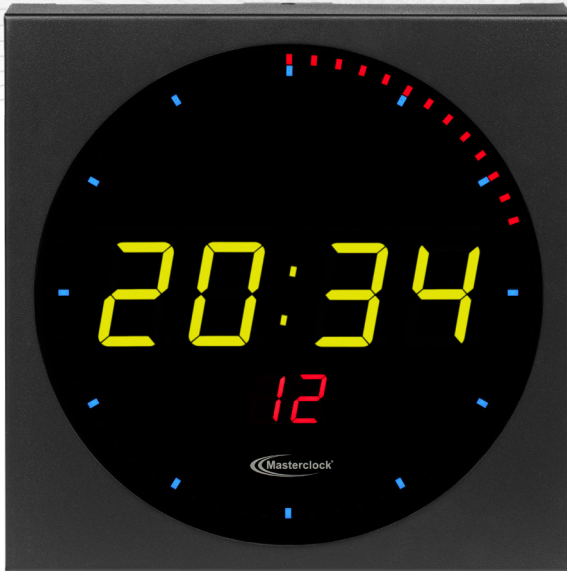
Shown with optional seconds display. LEDs available in red, green, blue or amber.