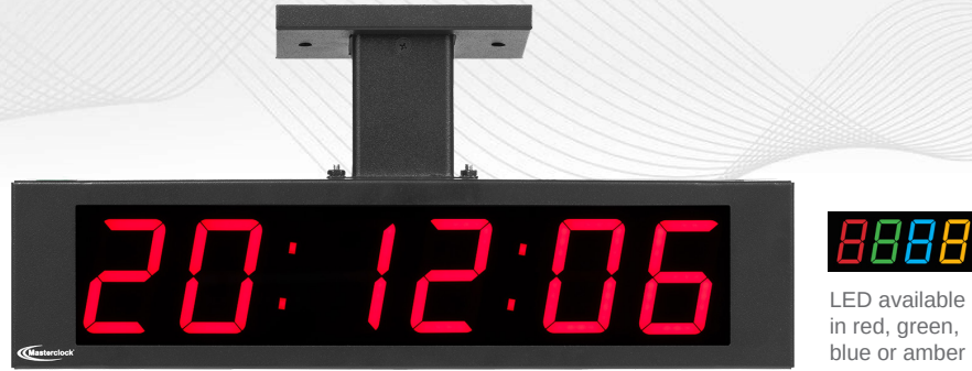
LED available in red, green, blue or amber

The TCDS26-DF Digital Clock syncs to IRIG-B, SMPTE and EBU time codes for accurate and traceable time. The unit configures to time zone and Daylight Saving Time parameters. WinDiscovery software is included.